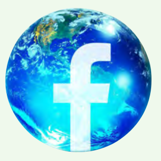
Earth Day SF Facebook